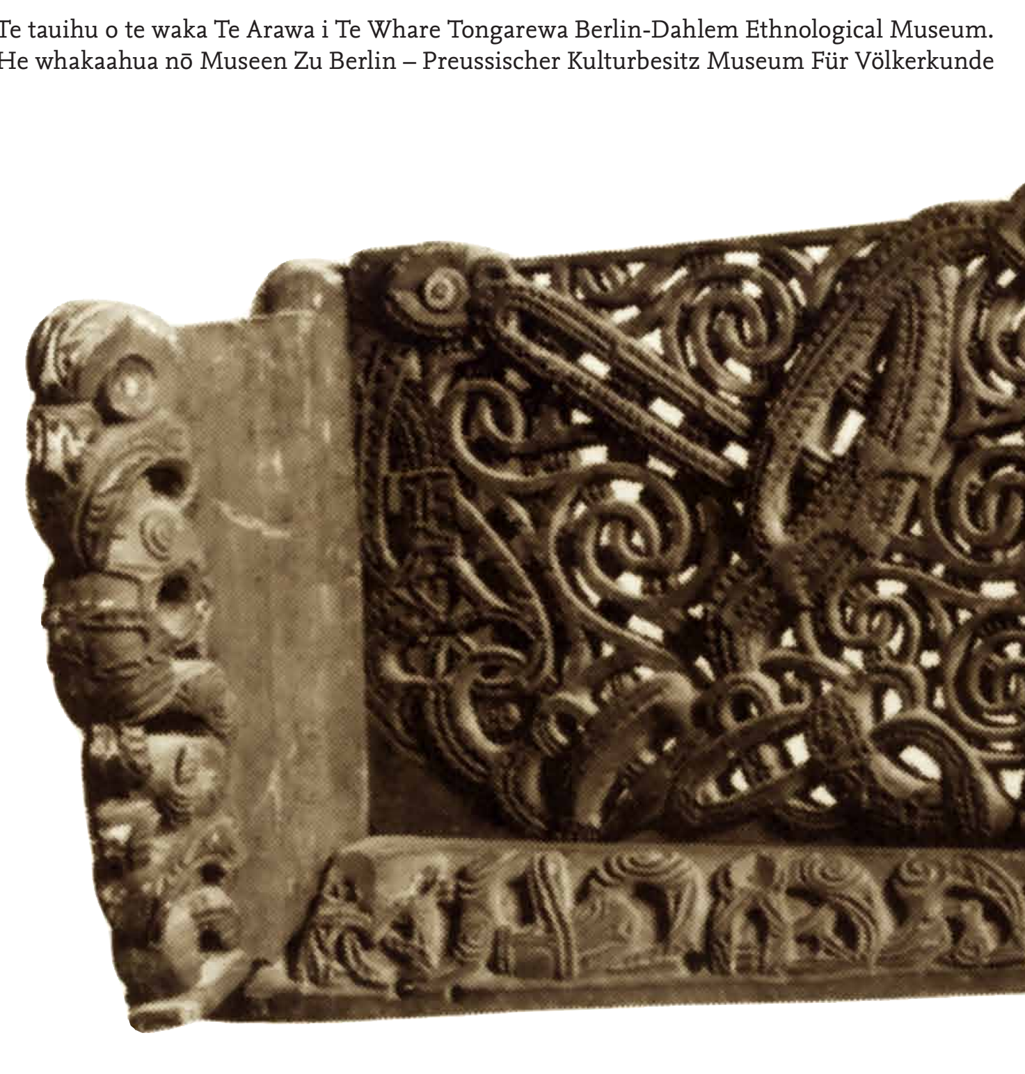
Te tauhu o te waka Te Arawa i Te Whare Tongarewa Berlin-Dahlem Ethnological Museum.