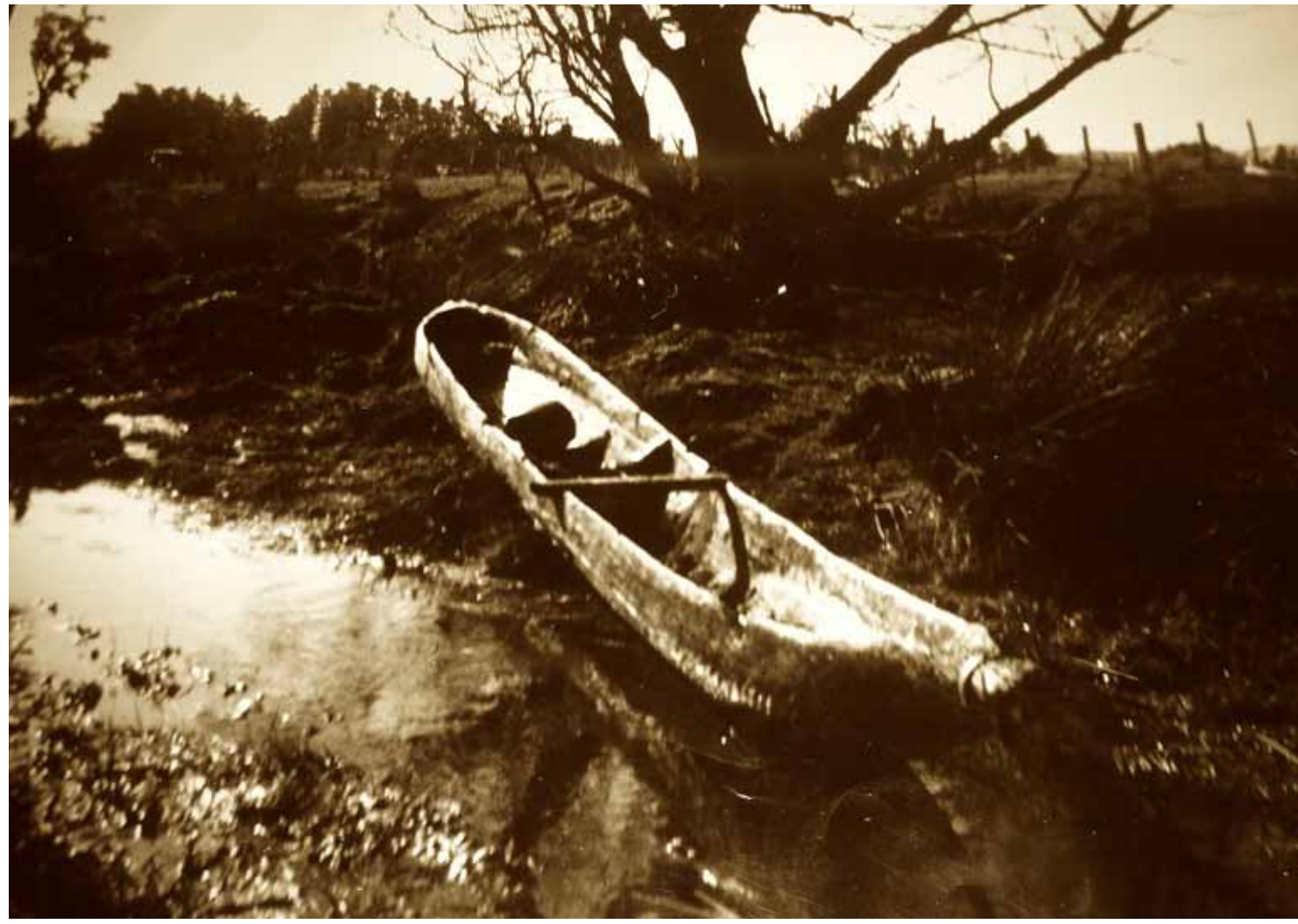
Kei tētahi repo ki Waibēnga tēnei waka, kei Te Wairarapa ki Te Tonga, nō te tau 1968. Ko Foss Leach te kaihopu whakaahua